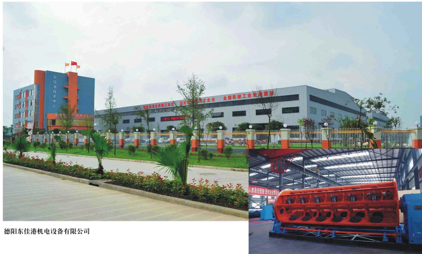
德阳东佳港机电设备有限公司